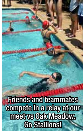
Friends and teammates compete in a relay at our meet vs Oak Meadow. Go Stallions!