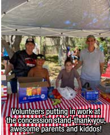
Volunteers putting in work at the concession stand - thank you, awesome parents and kiddos!