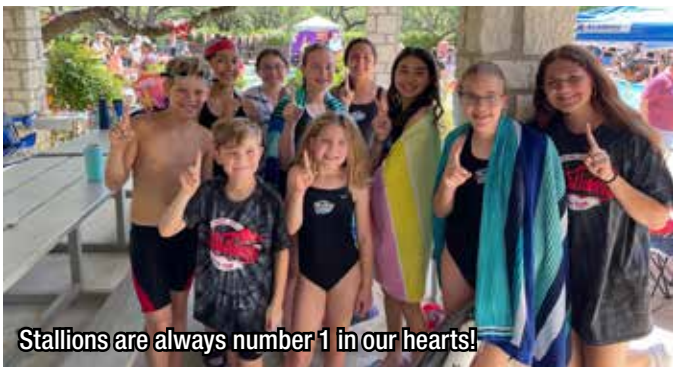
Stallions are always number 1 in our hearts!

Thank you to our residents for being flexible about pool use during swim team practice. We are working on permanent signage for next summer alerting residents to practice times so you all know when the pool is available for SAYOR. It has been a bit of a learning curve and again, we appreciate your patience! Next month we look forward to sharing who our award-winner swimmers of the season are. Until then, enjoy some pictures of Stallion swimmers having fun!